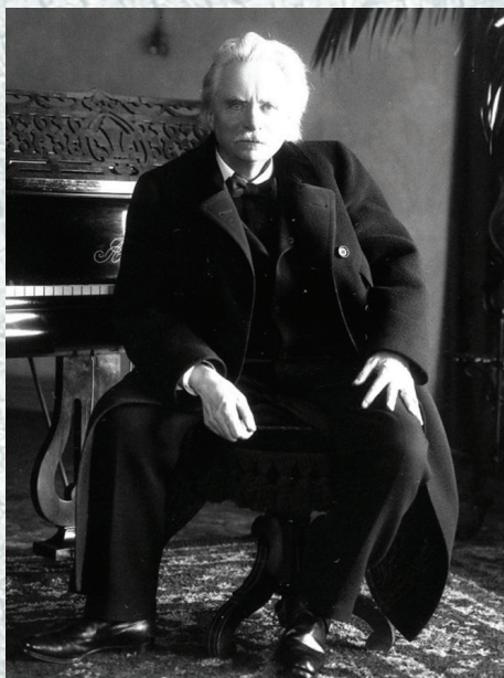
Edvard Grieg 1906

"The reaction occurred as I feared. Asthma, sleeplessness with difficulty in breathing, and the terrible hallucinations left me with only one wish: away, get away from it all. Nobody understands how little life is worth when one suffers like this. Nobody understands that then there is only one friend – death."